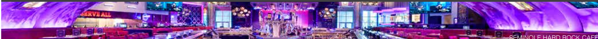
SEMINOLE HARD ROCK CAFE