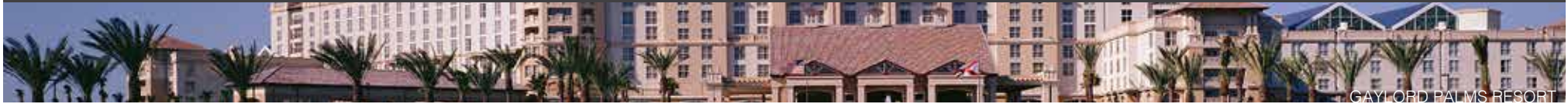
GAYLORD PALMS RESORT