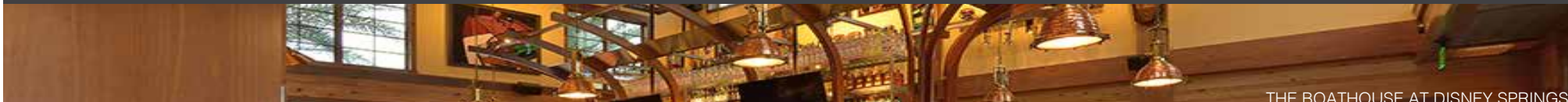
THE BOATHOUSE AT DISNEY SPRINGS