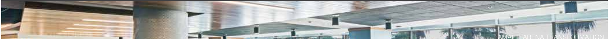
AMALIE ARENA TRANSFORMATION