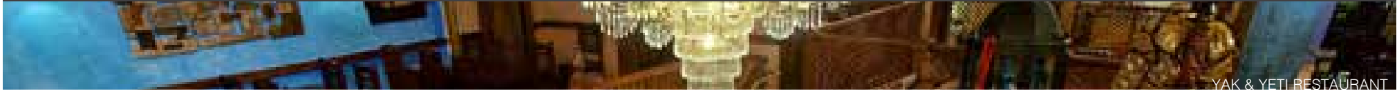
YAK & YETI RESTAURANT